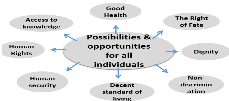
Figure (2) Showstyp of Quality of Life Indicators according to the new development model

The concept of quality of life is usually defined in the light of two basic dimensions, each of which has specific indicators: the subjective dimension, and the objective dimension. However, the majority of researchers focused on indicators of the objective dimension of quality of life. Which includes a range of observable indicators and direct measurement such as: working conditions, income level, socioeconomic status, and the amount of support available from the social relations network.