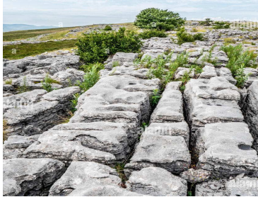
Fig 2. Lapiaz