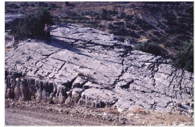
Fig 4. Fractured limestone slab