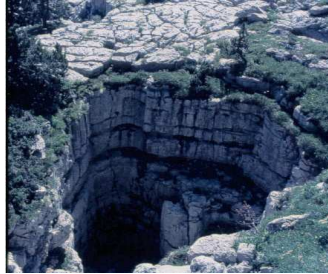
Fig 3. Chasm